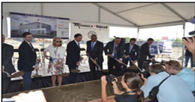
Fox Motors Ground Breaking Ceremony, 2014