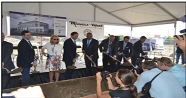
Fox Motors Ground Breaking Ceremony, 2014