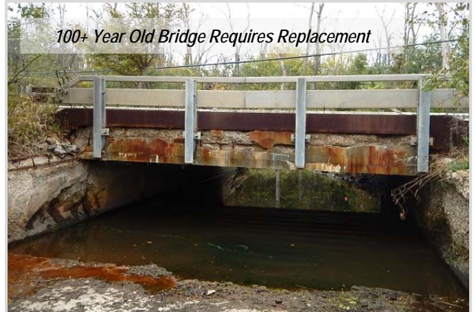
100+ Year Old Bridge Requires Replacement