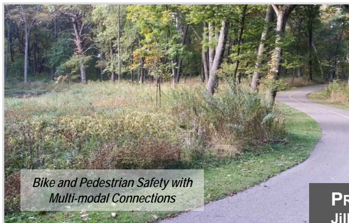
Bike and Pedestrian Safety with Multi-modal Connections