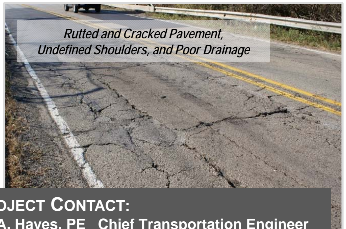
Rutted and Cracked Pavement, Undefined Shoulders, and Poor Drainage