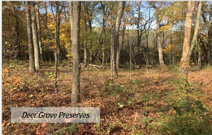
Deer Grove Preserves

This study will focus on the unique context of Quentin Road, addressing the deterioration of an aging facility, while striking a balance between the transportation safety and capacity demands and the adjacent environmental resources.