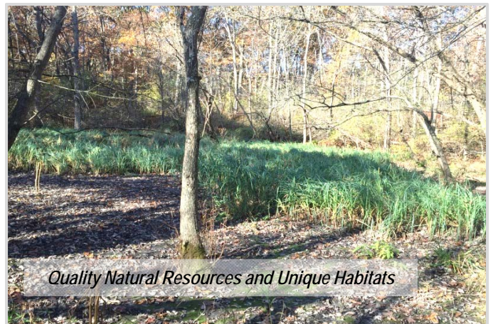
Quality Natural Resources and Unique Habitats