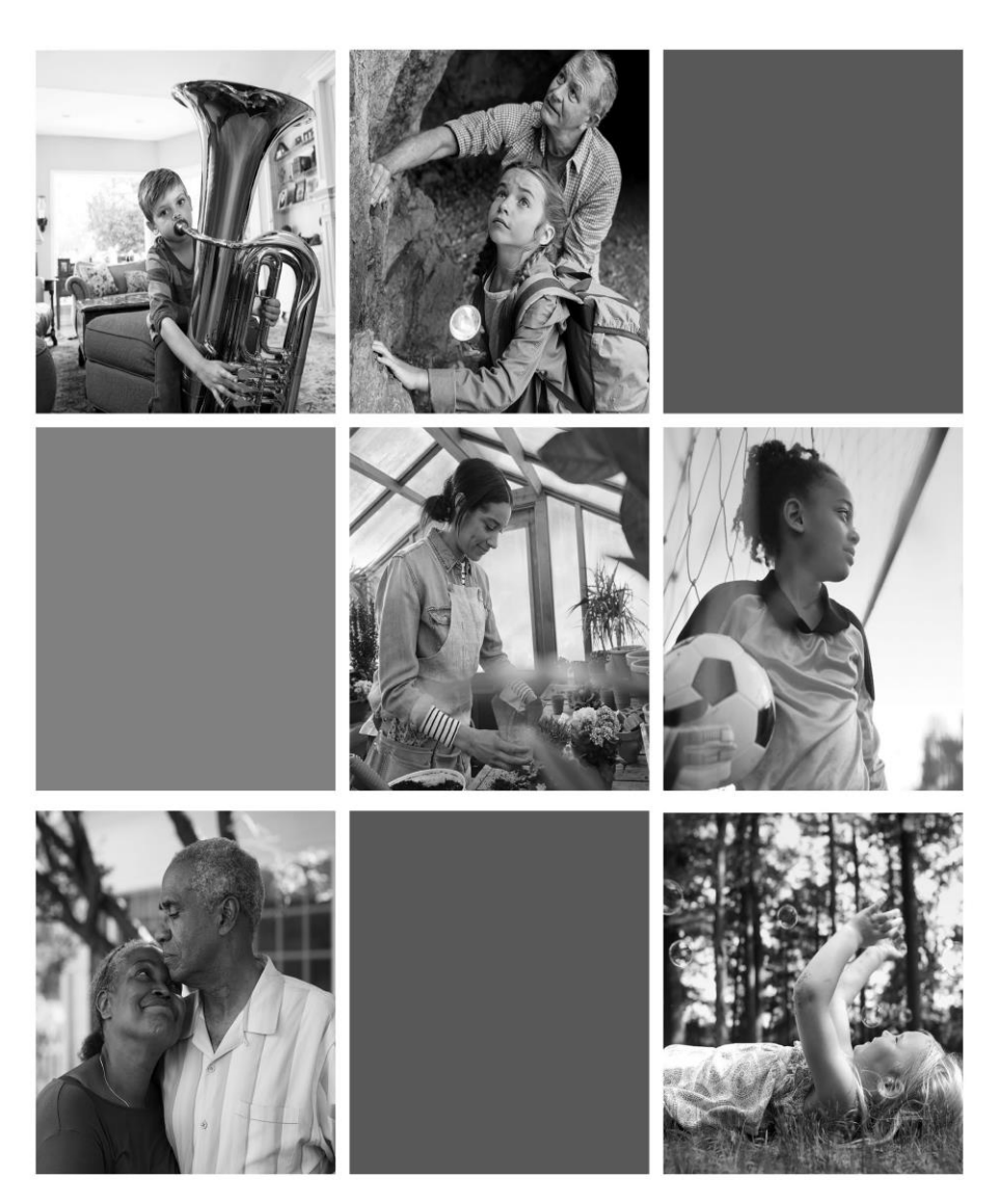
Your Health Care Benefits Program