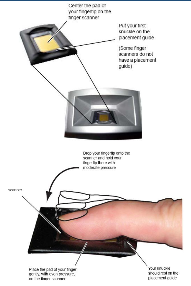
Correct finger placement on a finger scanner - side view